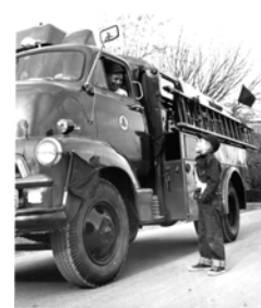
When I grow up...

Telephone directories --Bell System and Regional Bell Operating Company directories from 1890 through 2010, representing Arizona, Colorado, Idaho, Iowa, Minnesota, Montana, Nebraska, New Mexico, North Dakota, Oregon, South Dakota, Utah, Washington, Wyoming and about 60 years of El Paso, Texas books.