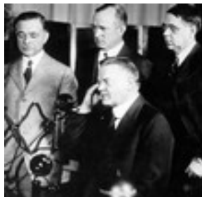
President Herbert Hoover 1929