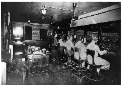
Santa Fe, NM Switchboard 1921

Photographs --Nearly 70,000 black-and-white prints and negatives (1876-1992), and over 10,000 color slides and prints.